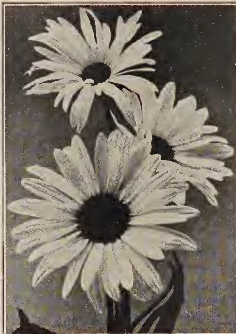
Heliosis, Double Lemoine Strain